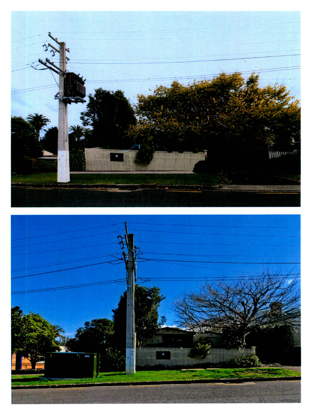
Cardwell Street, Onehunga – pole substation replacement