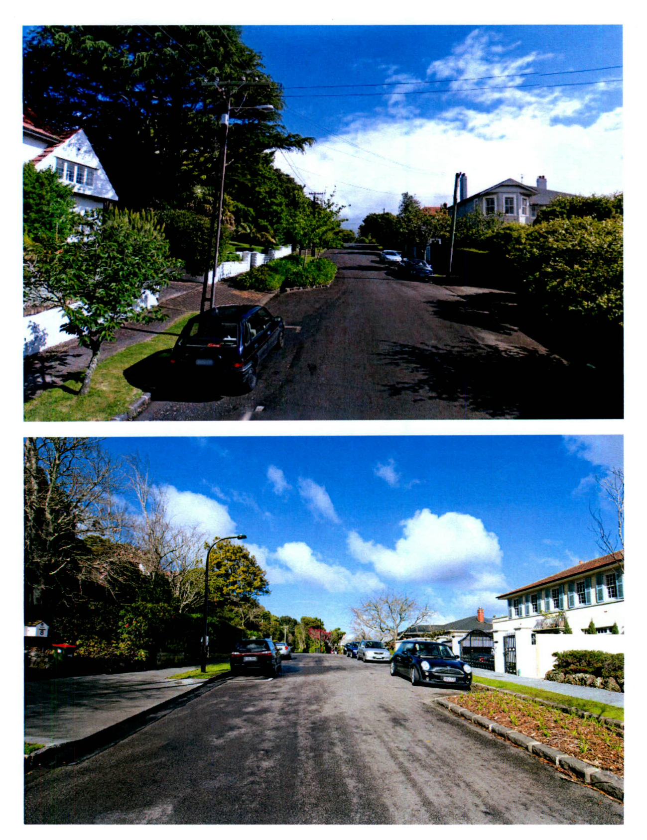
Belvedere Street, Mt. St. Johns - undergrounding