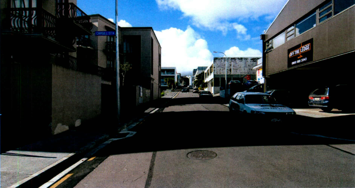
Randolph Street, Newton - undergrounding