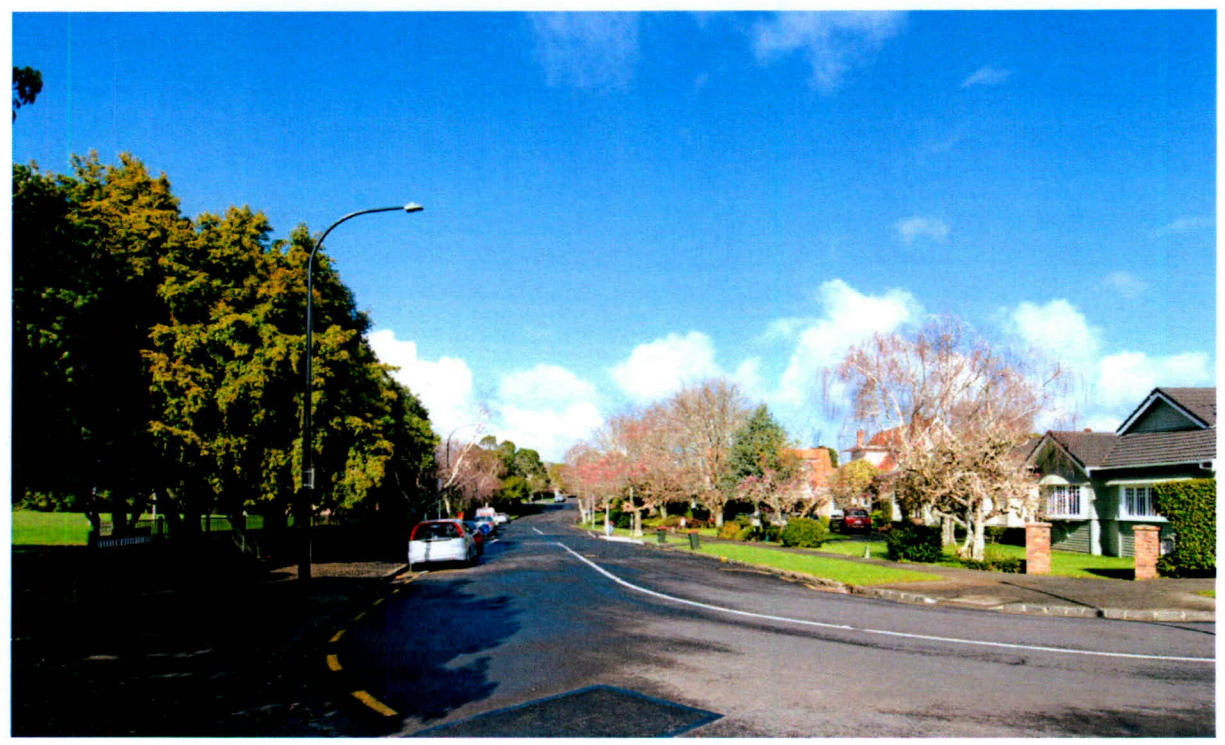
Platina Street, Remuera – undergrounding