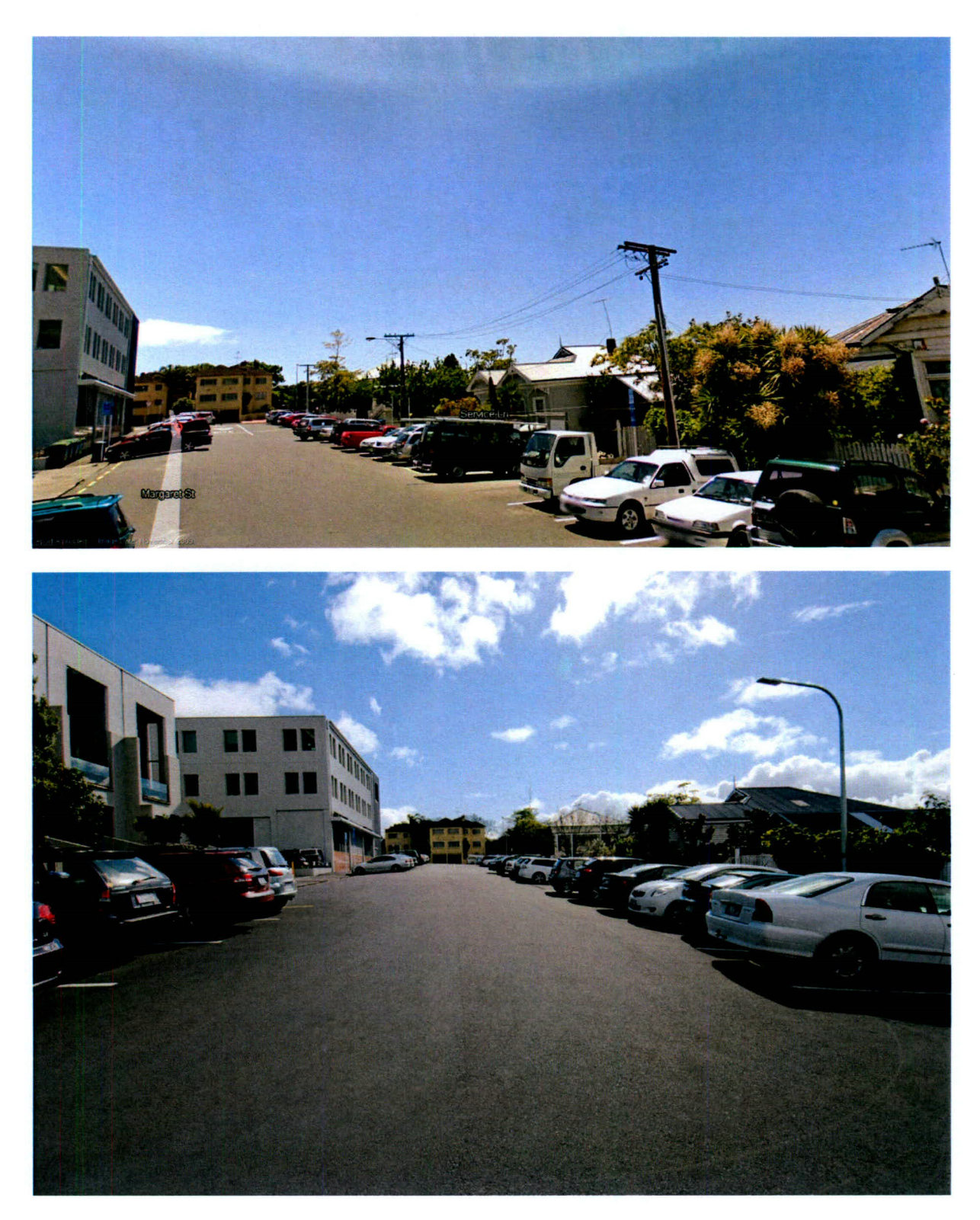
Margaret Street, Freemans Bay – undergrounding