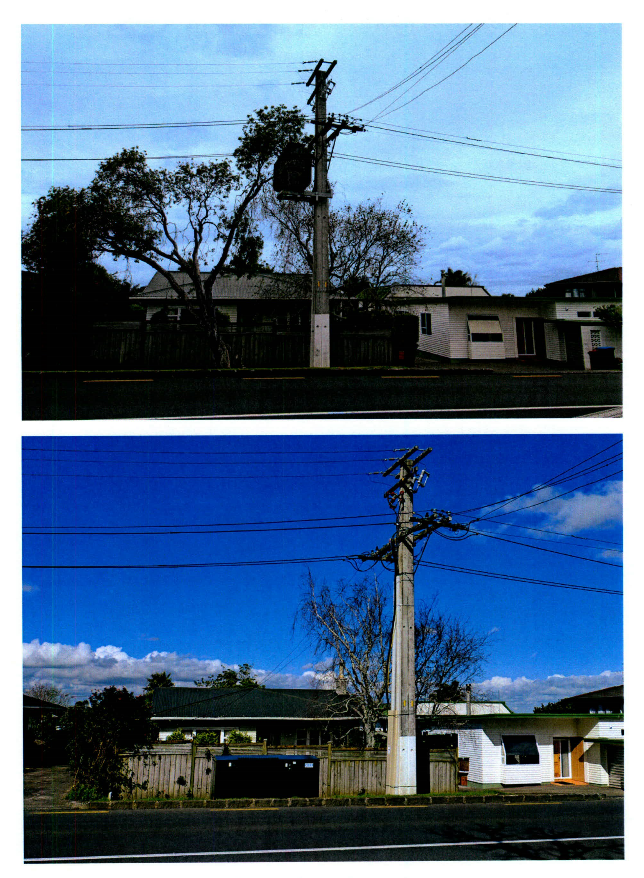
Campbell Road, Royal Oak - pole substation replacement