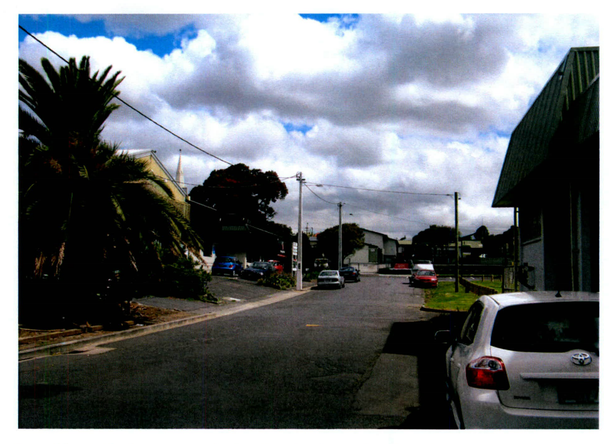
Rowe Street, Onehunga – Aerial Bundled Conductor (ABC) project