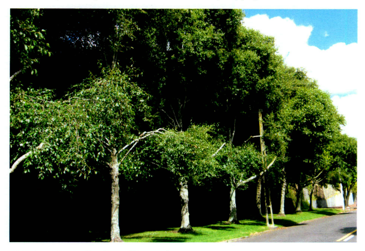
Mitchelson Street, Ellerslie – ABC project