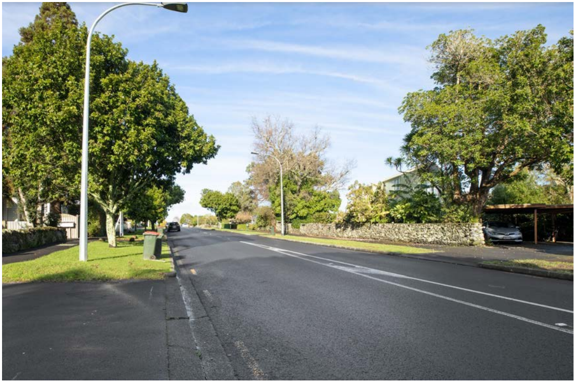
Woodward Road, Mt. Albert