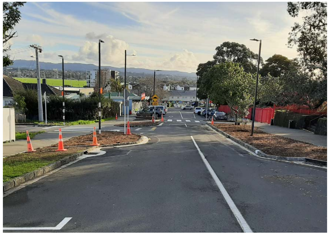
Crayford Street West, Avondale