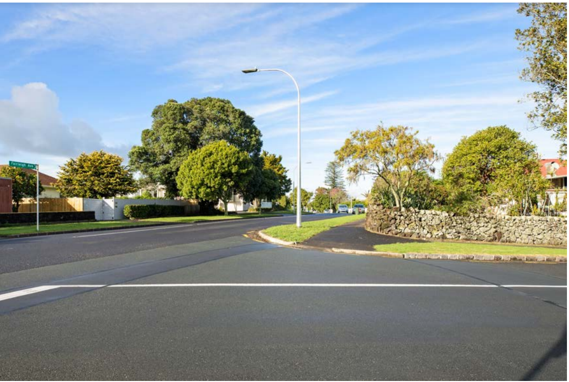
Woodward Road / Fairleigh Ave, Mt. Albert