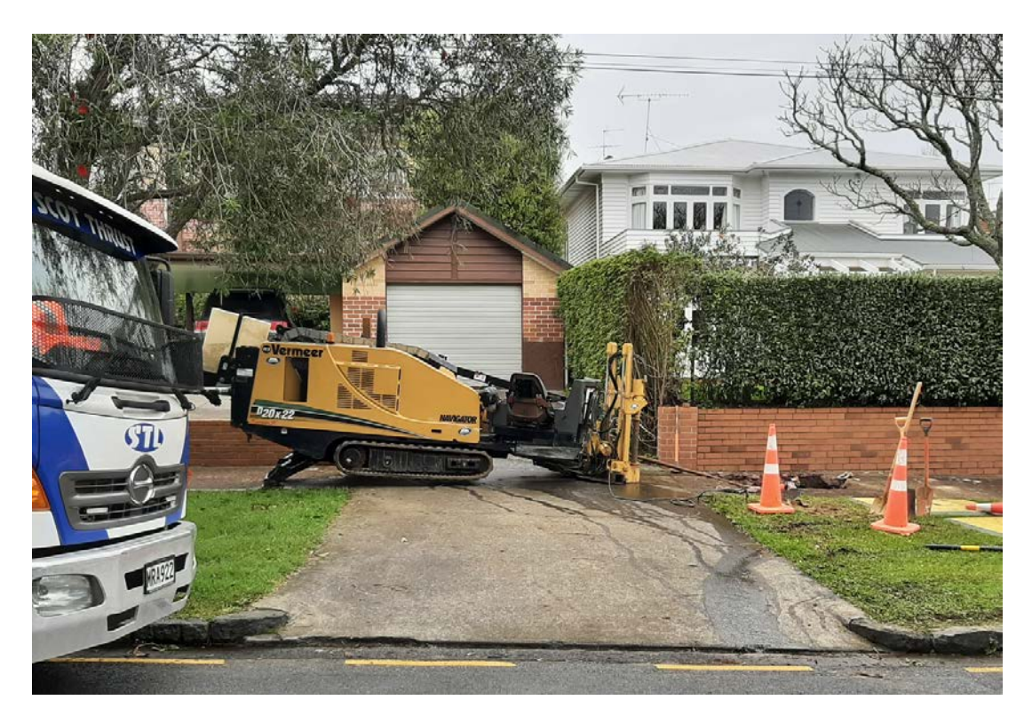
McArthur Street, St. Heliers (progress)