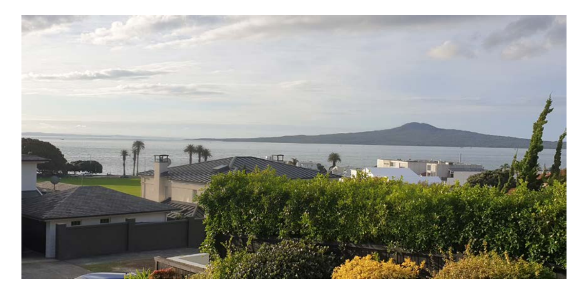
Brookfield Street, St. Heliers