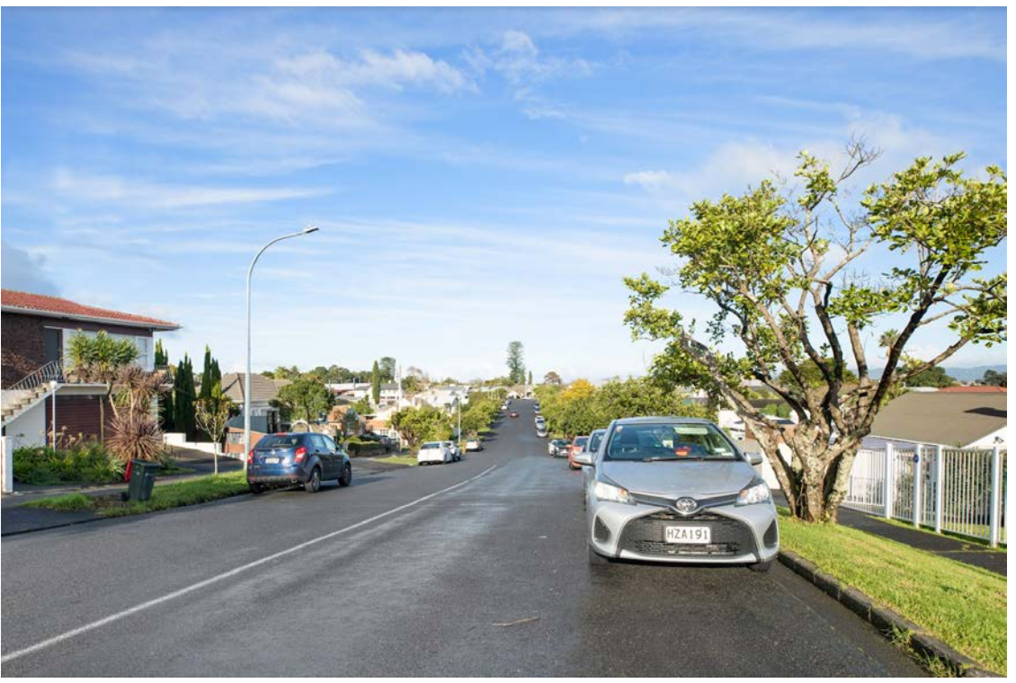
Willcott Street, Mt. Albert