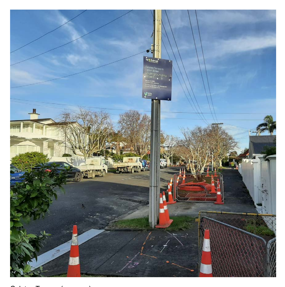
Galatea Terrace (progress)