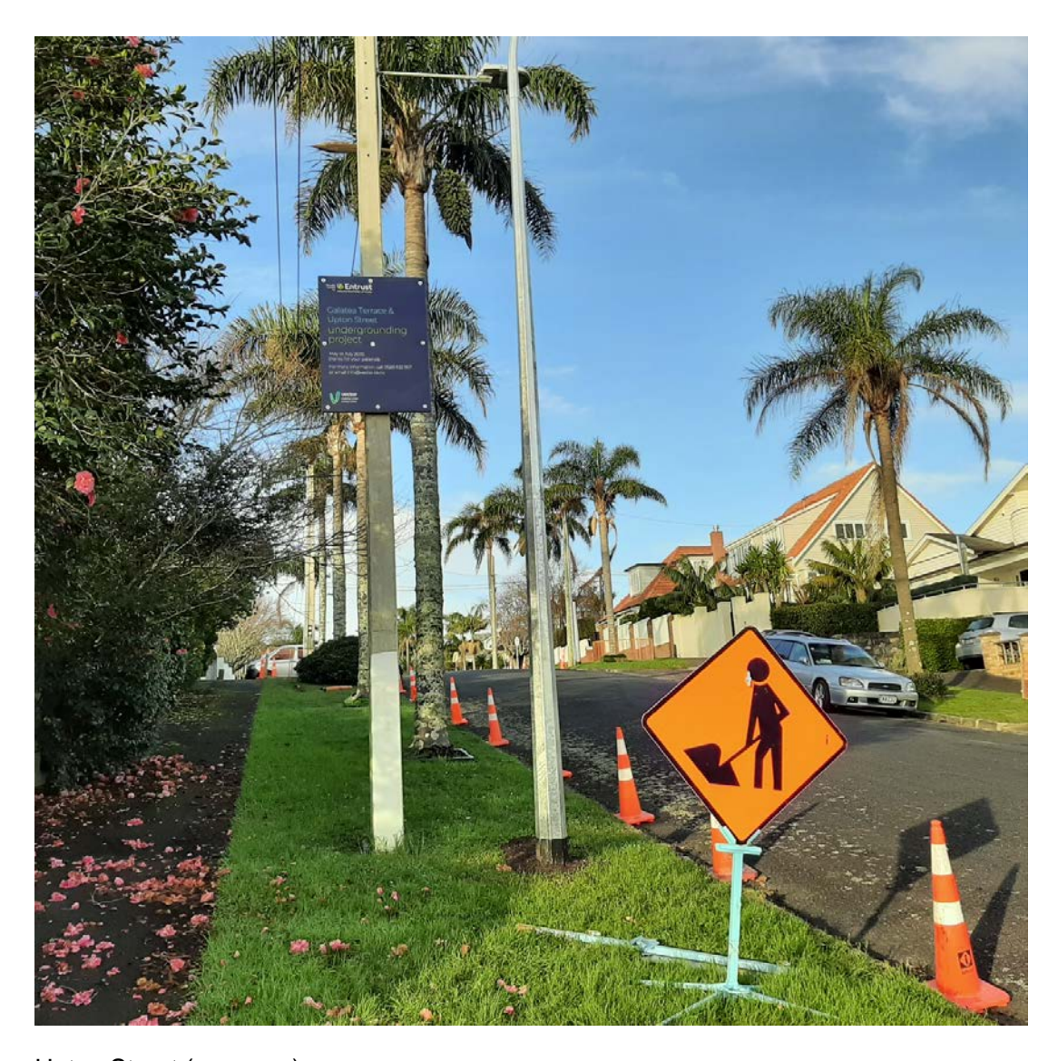
Upton Street (progress)