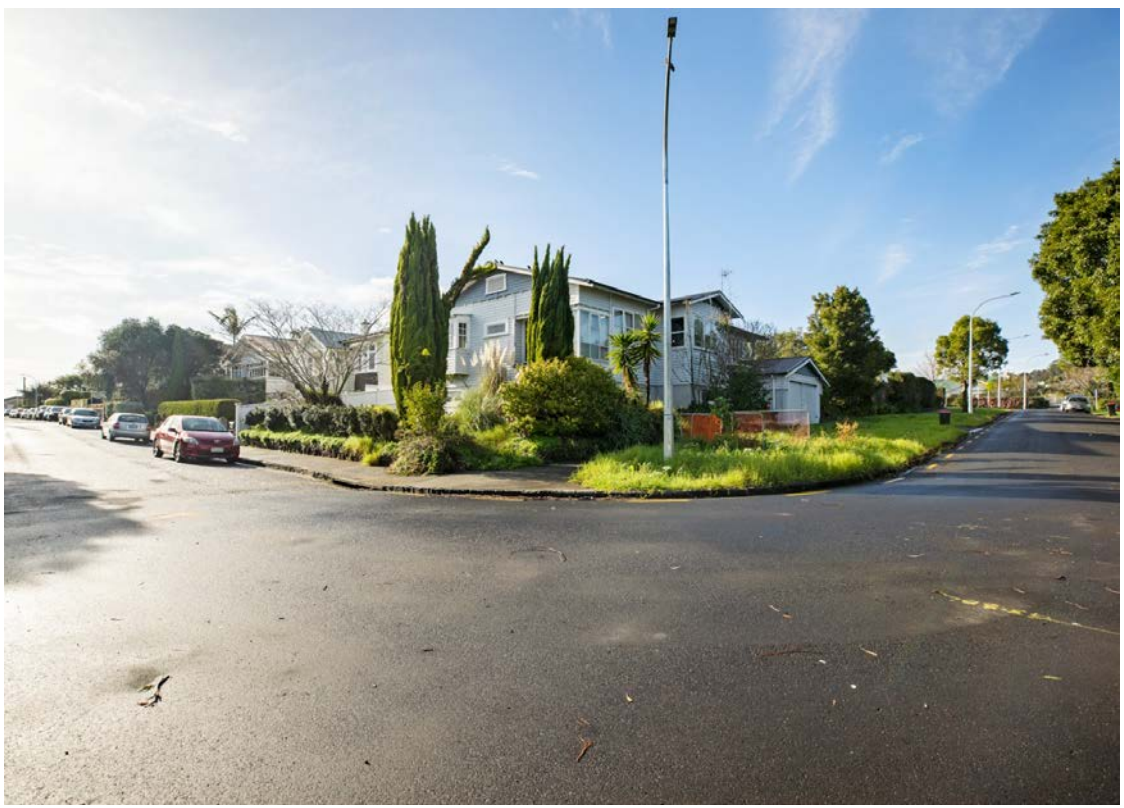
Benfield Street, Mt. Albert