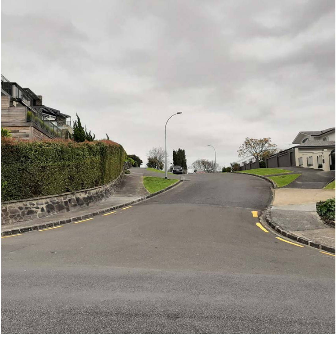
Brookfield Street, St. Heliers