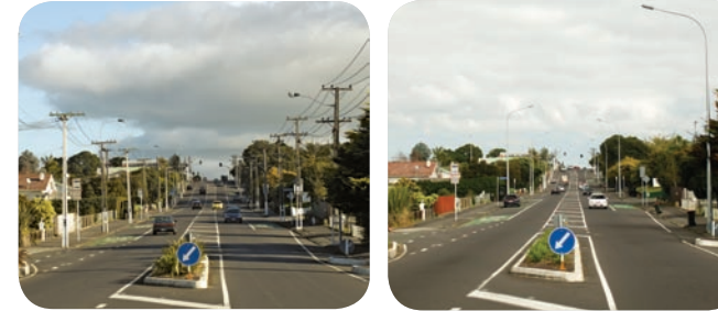
Sandringham Rd, before and after undergrounding.

One of the ways in which the AECT makes a real difference to Aucklanders' lives is our support of Vector's undergrounding programme – replacing ugly power poles with state-of-the-art underground cables, like at this recent project in Sandringham, completed in February 2009.